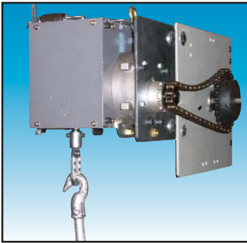
M100 Crank - Compact Design

Both systems feature all of the M100 FireGard Closing Systems benefits listed on the top front. Systems can be fuselink activated alone, or the system can also be tied into local detectors or a central alarm system using an operator mounted release device, see below. Automatic closing system is tested with routine close operation of the unit. Resetting spring tension or re-engaging the operator is not required! M100 Chain and Crank Operators are available in two sizes: Compact for use on all Counter Fire Doors and smaller size Fire Doors, and Standard for use on larger size Fire Doors. Consult factory for size limits.