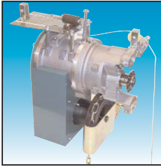
M100 Chain - Standard Design