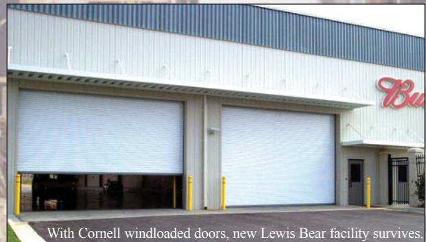
With Cornell windloaded doors, new Lewis Bear facility survives.