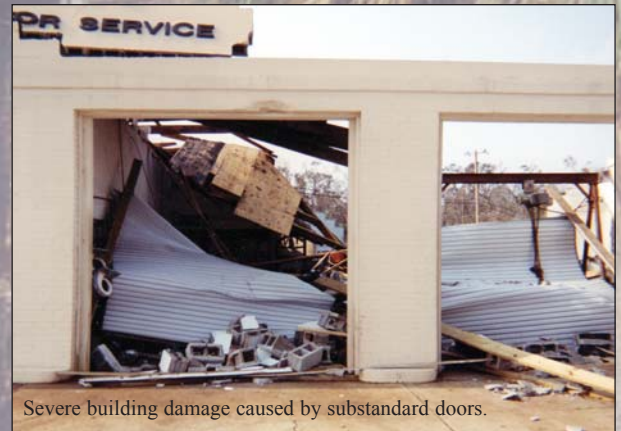
Severe building damage caused by substandard doors.

As building code requirements continue to demand greater windload performance, Cornell is there to answer the call with proven products. When it comes to the safety and security of your building, especially in extreme conditions, you can trust Cornell's expertise and more than 175 years of experience. Don't be left twisting in the wind. Make sure Cornell's hurricane tested doors are protecting your next project.