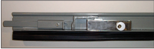
Photo also shows Bottom Bar Astragal, which is provided as standard.

Bottom bar locking device equipped for padlocking from coil or fascia side of curtain. Normally provided at both ends of bottom bar.